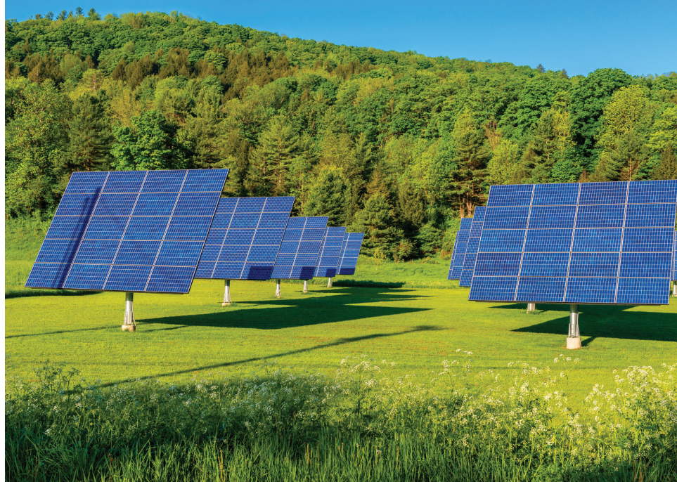
Advancing the clean energy economy while protecting natural resources

Go to nature.org/newyork to donate. Or you can email donate@tnc.org for more information.