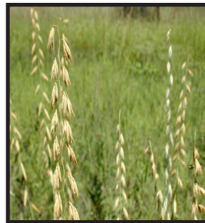
Side-oats grama - 10 - 40 in. Bouteloua curtipendula Matures: July - September