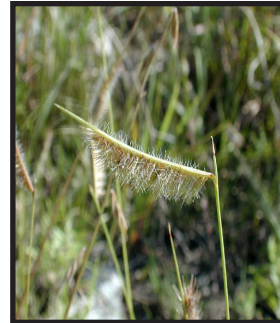
Hairy grama - 6 - 28 in. Bouteloua hirsuta Matures: June - August