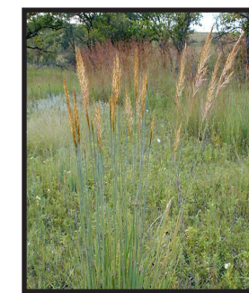
Indiangrass - 36 - 84 in. Sorghastrum nutans Matures: July - September