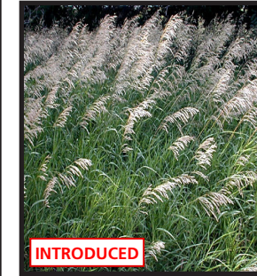
Smooth brome - 16 - 48 in. Bromus inermis Matures: May - July

These grasses can be found in some areas of the tallgrass prairie ecosystem, presenting problems in certain circumstances. Some have been introduced for their forage value and for use in lawns, while others are less desirable native species that can become invasive in the right conditions. They can all fiercely compete with more desirable grass species for resources and for that reason the preserve monitors them closely.