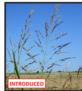
Johnson grass - 24 - 84 in. Sorghum halepense Matures: July - October