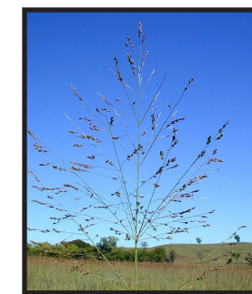
Switchgrass - 24 - 84 in. Panicum virgatum Matures: August - September

Tallgrass prairie once covered over 170 million acres in North America. Today less than 4% remains. Use this brochure while exploring the preserve to identify several common upland and bottomland tallgrass prairie grasses. Some of the grasses can be found in both areas. See how many you can locate!