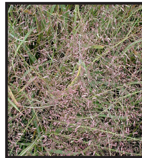
Purple lovegrass - 10 - 30 in. Eragrostis spectabilis Matures: August - September