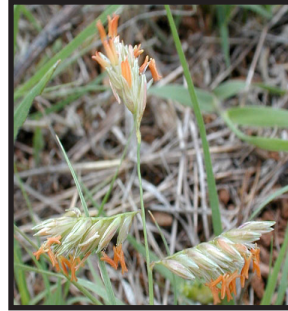
Buffalo grass - 2 - 8 in. Buchloe dactyloides Matures: May - June

Upland tallgrass prairie is prime grazing land for a wide range of grazing animals, such as cattle and bison. Shallow, rocky soils and steep hillsides make upland tallgrass prairie difficult to plow for crops, which helps to preserve more of its original characteristics, like high plant diversity and dense, deep root networks. These combine to make upland tallgrass prairie very resilient and adaptable to a wide range of environmental conditions.