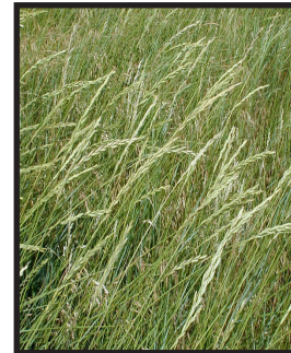
Western wheatgrass - 12 - 36 in. Pascopyrum smithii Matures: June - September