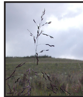
Purpletop - 24 - 60 in. Tridens flavus Matures: July - September