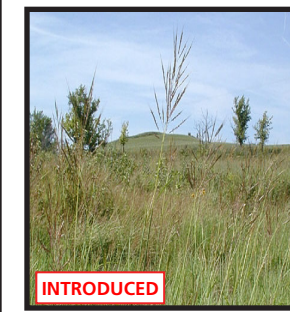
Caucasian bluestem - 24 - 36 in. Bothriochloa bladhii Matures: July - October