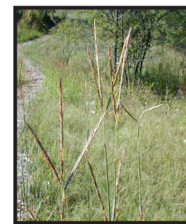
Big bluestem - 24 - 84 in. Andropogon gerardii Matures: July - September