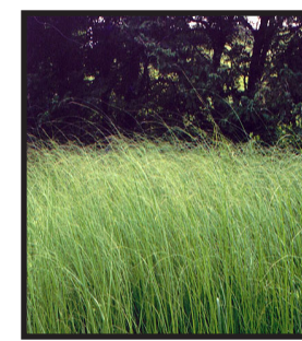
Prairie cordgrass - 36 - 84 in. Spartina pectinata Matures: August - October