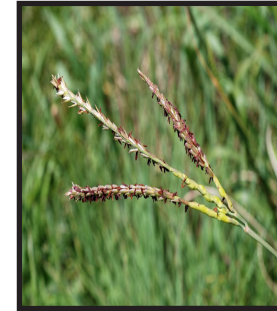
Eastern gama grass - 48 - 96 in. Tripsacum dactyloides Matures: June - September