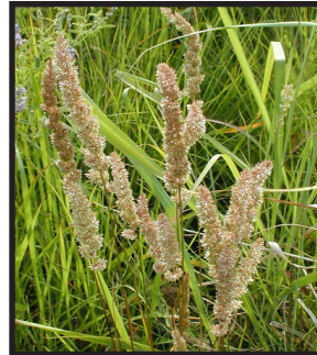
June grass - 8 - 24 in. Koeleria macrantha Matures: May - July