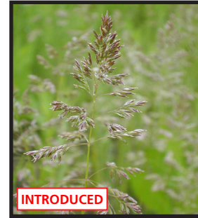
Kentucky bluegrass - 4 - 40 in. Poa pratensis Matures: May - July