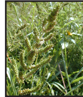
Barnyard grass - 12 - 60 in. Echinochloa muricata Matures: July - September