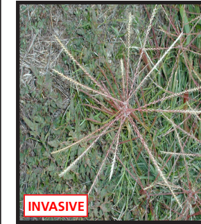
Windmill grass - 4 - 16 in. Chloris verticillata Matures: May - September