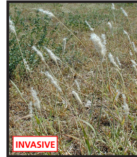
Silver bluestem - 18 - 42 in. Bothriochloa laguroides Matures: July - September