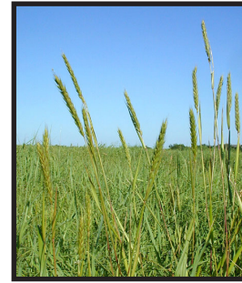
Virginia wild rye - 24 - 48 in. Elymus virginicus Matures: May - July

Bottomland tallgrass prairie remains an extremely rare part of the tallgrass prairie ecosystem. These large, level areas with their deep, nutrient-rich soils and better access to moisture were ideal for the planting of crops and other agricultural uses. Since bottomland tallgrass prairie is so rare and could support some of the tallest tallgrasses, the preserve is working to restore approximately 500 acres of this nearly extinct area to its natural state.