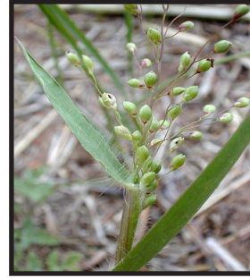
Scribner's panicum - 6 - 24 in. Dichanthelium oligosanthes Matures: May - June